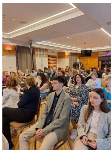
7th international CAP conference in Hotel Dubrovnik, Zagreb