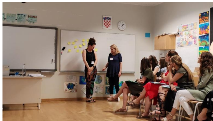
Primary School Žnjan-Pazdigrad, Split – Elementary CAP

7th international conference "CAP in the digital age" was held on May 8, 2024 at the Hotel Dubrovnik, in cooperation with the European organization COFACE Families Europe from Belgium. 39 people from the Republic of Croatia (local community representatives, CAP teams, external collaborators) participated, as