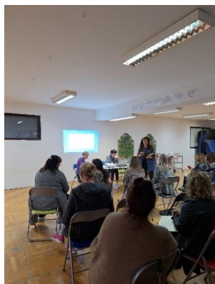
DV Bajka, Zagreb