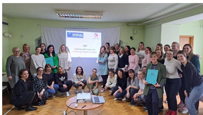
DV Izvor, Zagreb