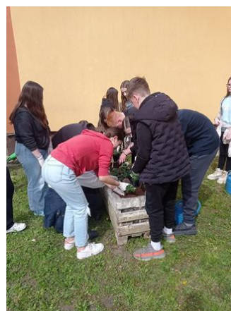
Volunteer action, St. Ivan Zelina

resolution, and volunteer actions. In Sveti Ivan Zelina, the volunteer action included landscaping the Srce Association, which operates as a local volunteer center and provides services to people with disabilities, which included painting the walls in the environment. In Jastrebarsko, the volunteer action included landscaping the Ljubo Babić Elementary School and planting strawberry seedlings.