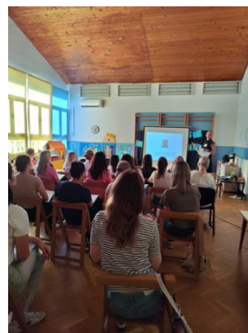
DV Bili cvitak, Sinj