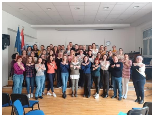
I. Technical School Tesla, Zagreb – TeenCAP