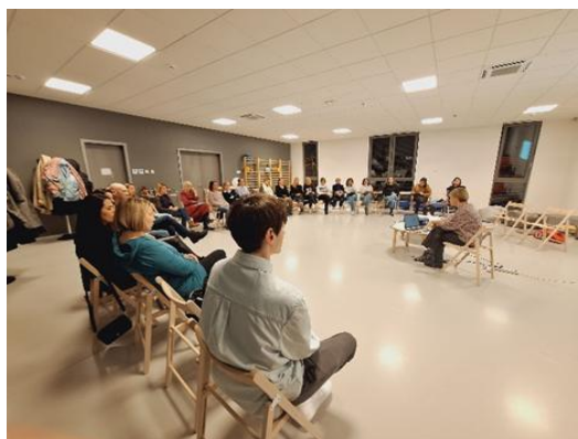
DV Zrno, Zagreb